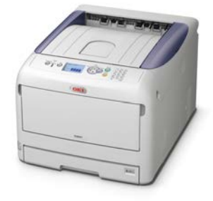
C831DN OKI C831dn Laser Printer (A3) Color: CMYK, A3 size