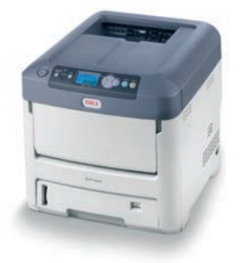
C711WT OKI C711WT Printer (A4) Color: CMY WHITE, A4 size