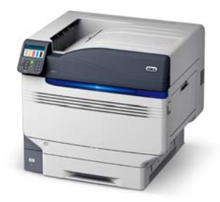
C941DN OKI C941dn Printer (A3) Color: CMYK WHITE, A3 size