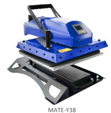
MATE-Y38 Mate Swinger Press (38*38cm)